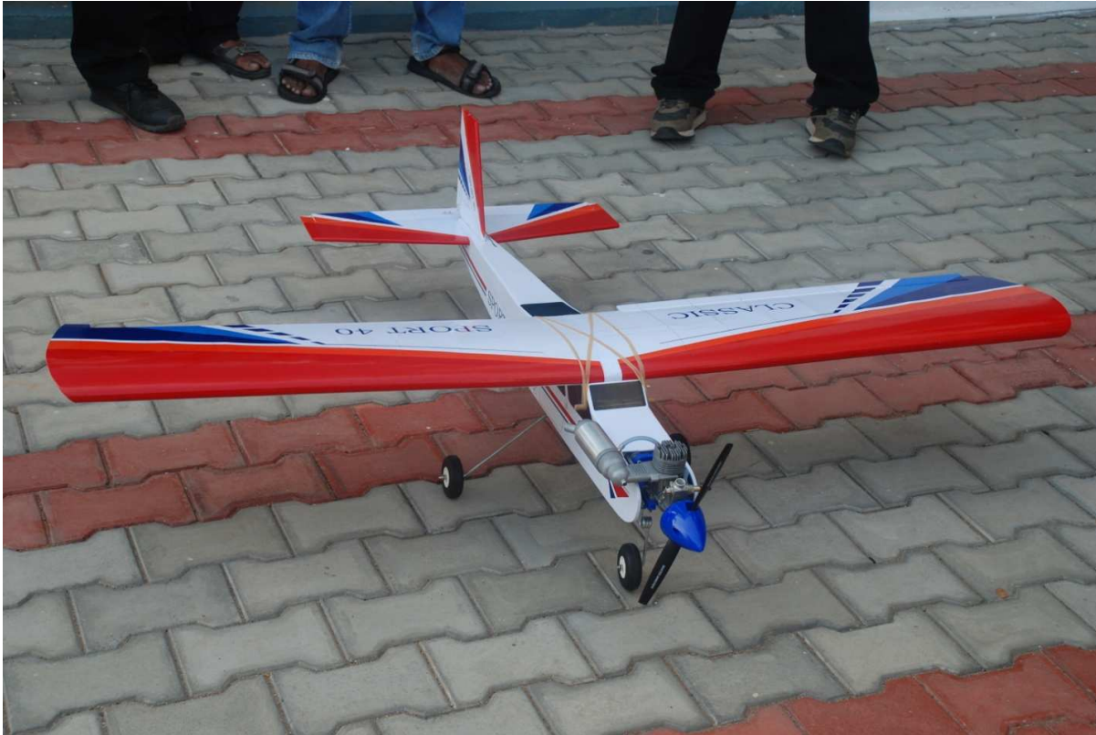
A Powered Glider at the Aero Modeling Event

The Auto Quiz was conducted in 2 sections. A preliminary written round to screen out the finalists and the final brainstorming section of the conventional quiz blitzkrieg. The event was conducted and judged by quiz master Mr. Ganesh of BSA Crescent.