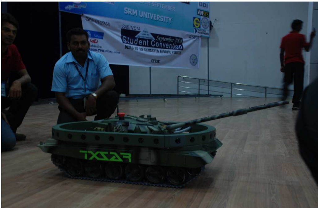
Robotic Combat Vehicle Demo

The competitive events concluded on the first day of the convention. 27 th September saw a variety of demo events- Robotic Combat Vehicle demo in association with CRVDe, Technology Theatre consisting of Video Conferencing by WABCO and an Aero Showcase in which the working of various models of RC gliders and planes were demonstrated and their underlying principles were explained.