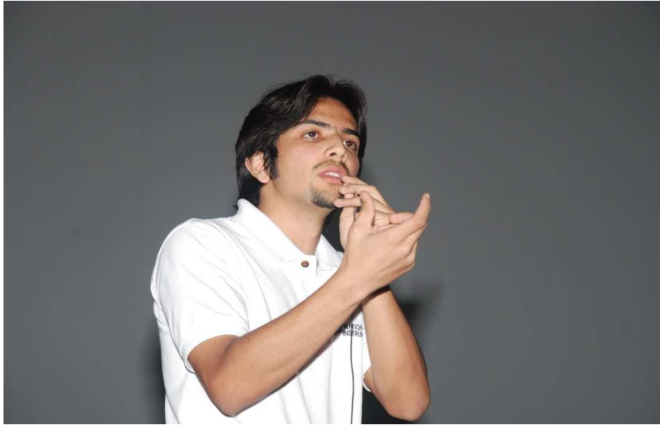
A Participant at Students Business Plan

The teams were given 15 minutes to present their papers in Technical Paper Presentation. The teams were judged on the originality and practicality of their papers.