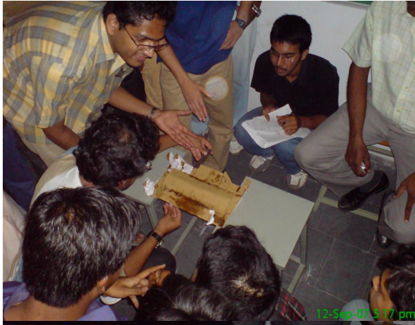
12-Sep-07 5:17 pm