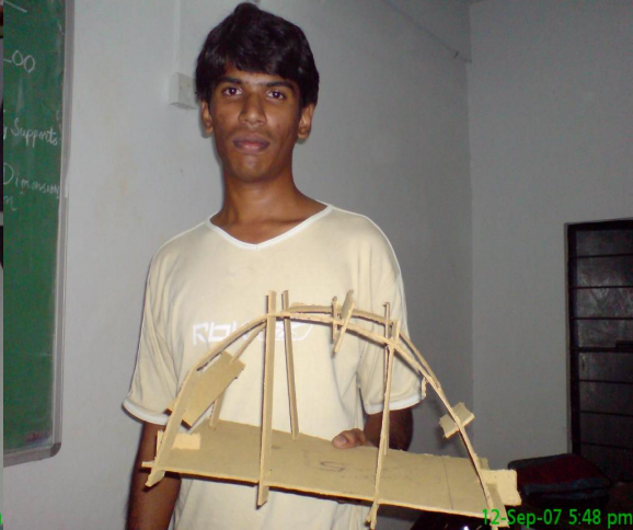
12-Sep-07 5:48 pm