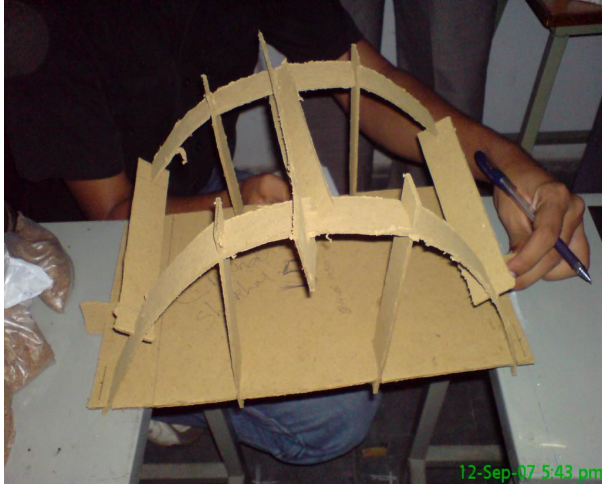
12-Sep-07 5:43 pm