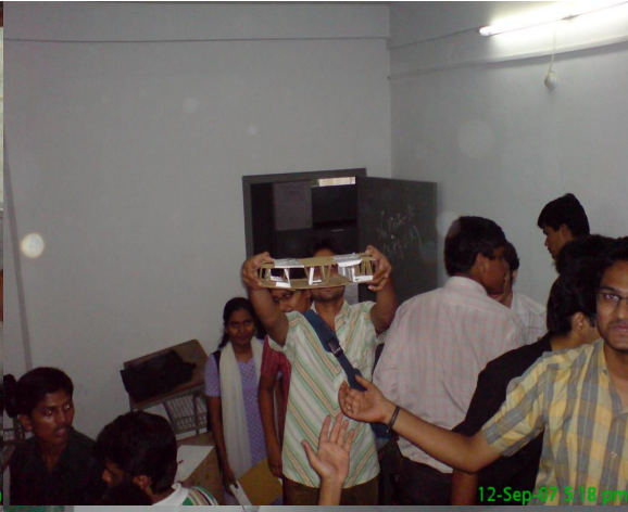
12-Sep-07 5:18 pm